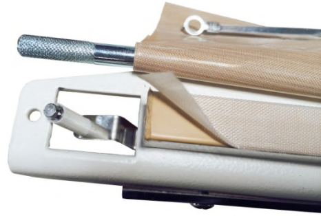
Figure 4. Remove PTFE adhesive