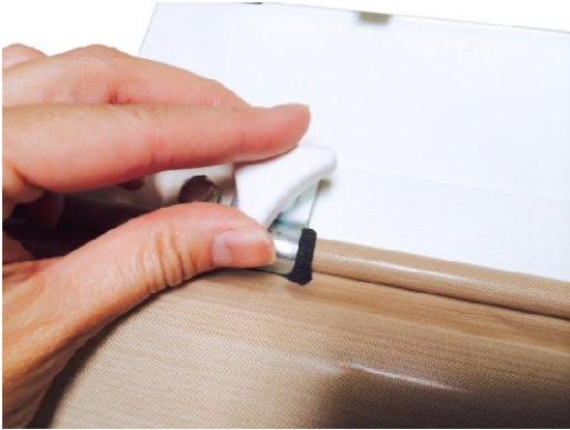
Figure 5. Loosen multi-star knob to remove the PTFE roller.