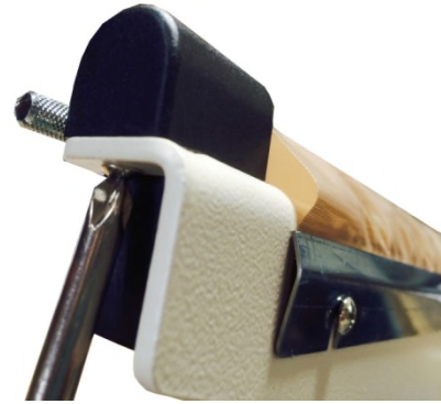
Figure 2. Remove heating element cover