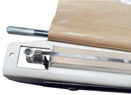
Figure 3. Remove heating element from mounting spring